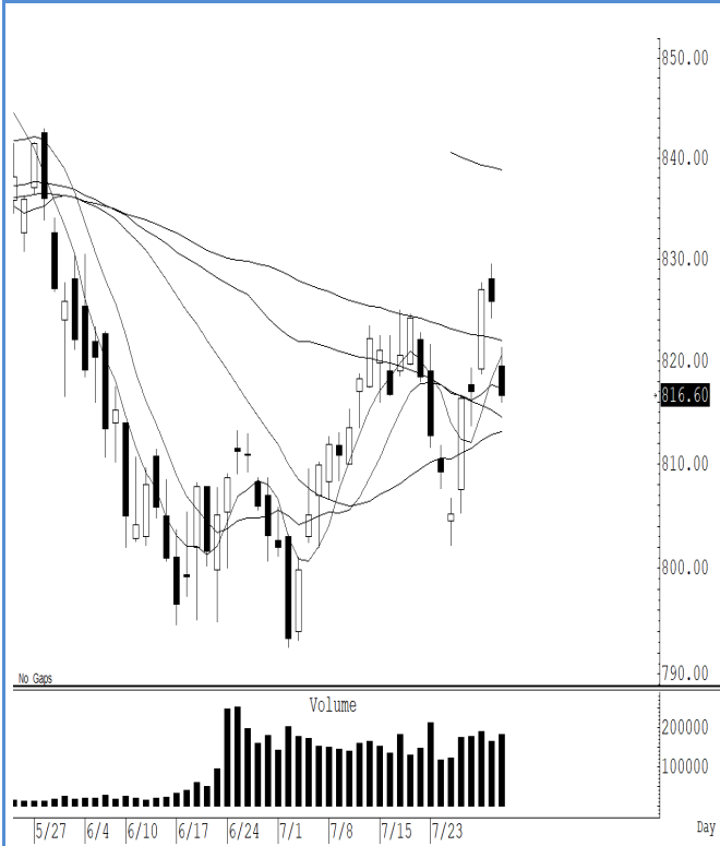
S50U24 (Close 816.60 Chg -9.20)

แกว่งในกรอบ แต่ยังคงระวังภาวะผันผวนในลำดับต่อไป เนื่องจากวันศุกร์กลับมาเปิด gap ลง แนะนำ trading ในกรอบ 820-795 จุด ระวังถ้าไร ในกรณีที่ปิดต่ำกว่า 792 จุด แนะนำ ถือ short